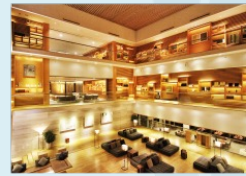
Aviation & Hospitality