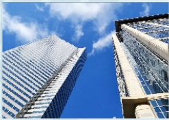
Real Estate & Smart Townships