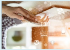
Banking & Insurance