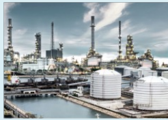
Energy & Utilities