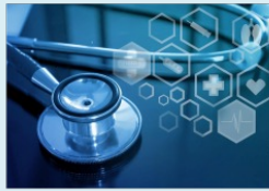
Healthcare & Pharma